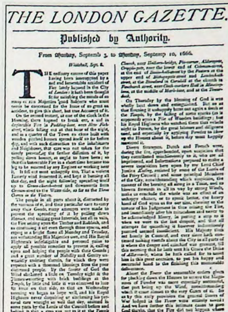
The London Gazette : later reprint of the front page from 3–10 September 1666, reporting on the Great Fire of London.

Therefore it is possible to consider " The London Gazette " as an ambiguous legal authority rendered a fictional newspaper of the Throne, of the Crown, of Her Majesty , of The QUEEN , of Queen Elizabeth II, and of the British government. This is plausible.