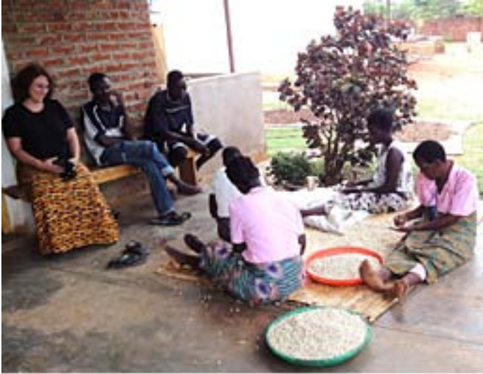
Making herbal powder at the Herb Clinic

Within the first week they had all lost their various health complaints.