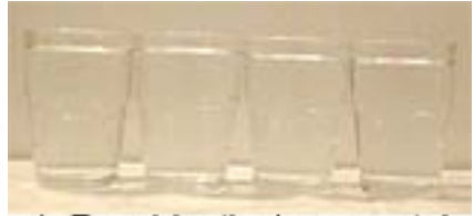
1. Four identical non-metal containers: 25% each of total water

Step 1: Each of the four containers holds 25% of the total water, but we need 28%. To make things go smoothly at this point, please dump the water from containers 1 and 2 into the mixing container, which in this case, is a glass coffee pot.