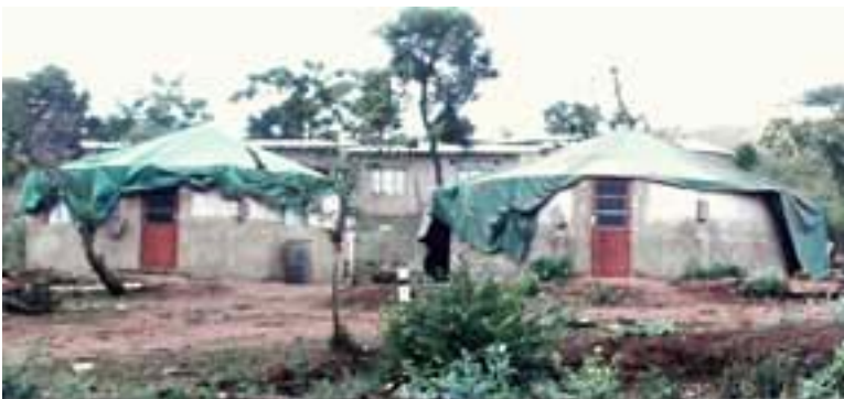
Round houses in the Zulu complex

These houses have no partitions. They are just a big round building with beds, TVs, couches, chairs, and other electronic items and clothes. The food is prepared and served in another house. Bathing is done outdoors, normally in a bucket of water. The weather is usually warm so this is possible most of the year. The toilet is an outhouse.