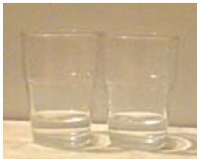
5 & 6. Two containers eighth full (3.125% ea.)

Step 7: So now pour one of the 3.125% contents into the coffee pot and save the other one. The pot now holds 71.875% of required water.