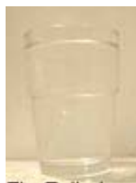
7b. Full glass (25%)

Step 10: Notice in the #11 & 12 picture below that a piece of white tape has been put on narrow container #1. But don't attach the tape until that first container is floating in the second one. Then put the tape in place and