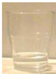
7a. Glass eighth full (3%)

Step 9: Pour some water into narrow container #2. Use a little more water than is in the first one because the first one must float in the second one without touching bottom. Now, if we do the following steps properly we will have 28% NaClO 2 by weight in the coffee pot.