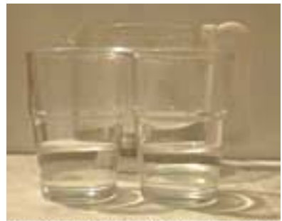
4. Two containers quarter full (6.25% each)

Step 4: Take the remaining 12.5% container and pour half of it into the container that you just emptied into the coffee pot. Make sure that both containers have an equal amount of water in them. Use a spoon or even an eye dropper to make sure they are even. Now both containers have 6.25% of the whole amount of water we started with. We don't need one of the 6.25% waters, but don't discard it – it goes into the mixing container (coffee pot).