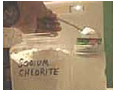
11 & 12. First container taped and marked. Add \text{NaClO}_2 to same mark.

Once it is totally dissolved, put it in a glass or plastic bottle until it is completely clear, which will be in a few hours. Since \text{NaClO}_2 looks like water, do not leave it in this bottle without attaching a clear label. Without a label, it could be a life-threatening bottle. It has no smell to distinguish it from water and it could kill or cause serious