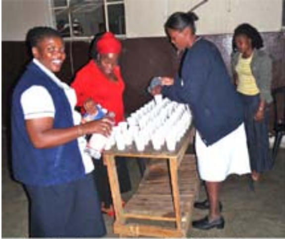
Jim's helpers preparing MMS doses for the 500 students

On about the 4th day I was there, Zondo moved the bunch up to the mountain top where his hospital was being built. I was supposed to begin teaching MMS classes to a group of 50 students that he picked