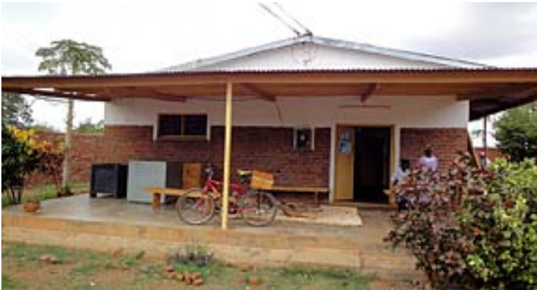
Jim's bike at the Herbal Clinic

Finally, after spending a thousand in one month, I bought a bicycle. It cost $100 and I had one of the carpenter shops make a wooden box and mount it on the back. The box was big enough for most of the things I carried and if something was too big, I tied it on top of the