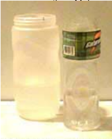
9 & 10. 28% water weight in 1st narrow container and more in 2nd

up-and-down mark on the brim of the second narrow container so that you always use the same place to check the float.