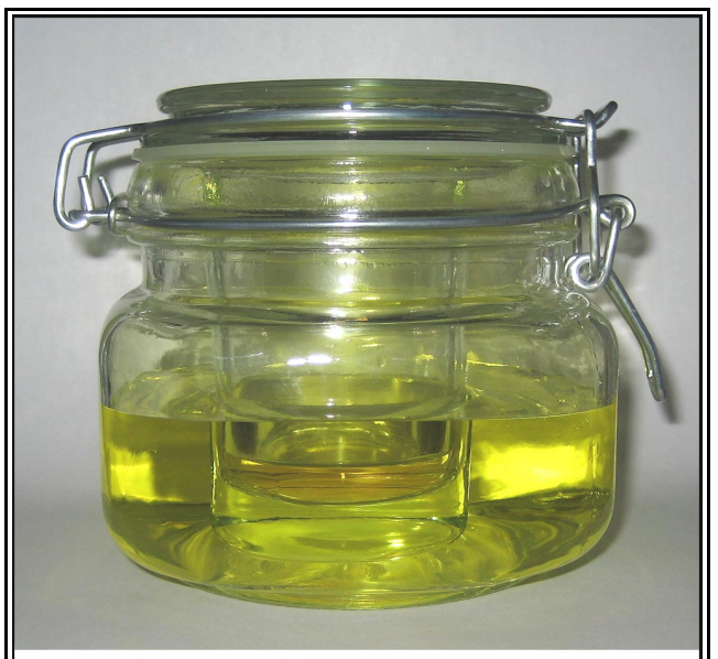
240ml distilled water + 5ml MMS + 5ml 4% HCL. 24 hour double infusion, once at the start of the test and a second at + 12 hours. 1650 \rightarrow 3100 \text{ ppm} single infusion vs double infusion.