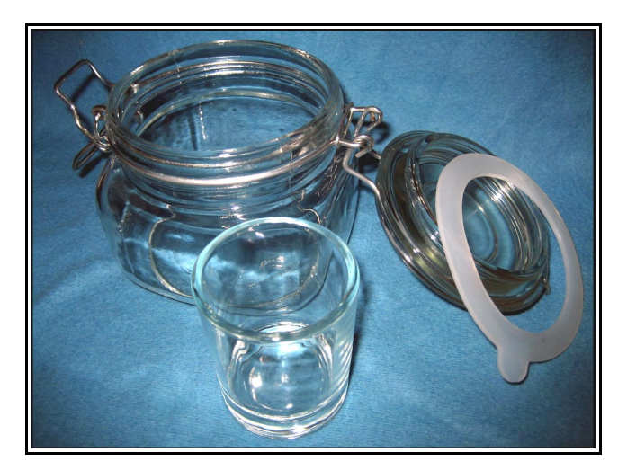
500 ml capacity clamp-lid glass receiver container, silicone lid-to-jar gasket , and 90 ml capacity reactor glass candle holder. Reactor is 2" (5 cm) diameter, 2.5" (6.35 cm) tall.