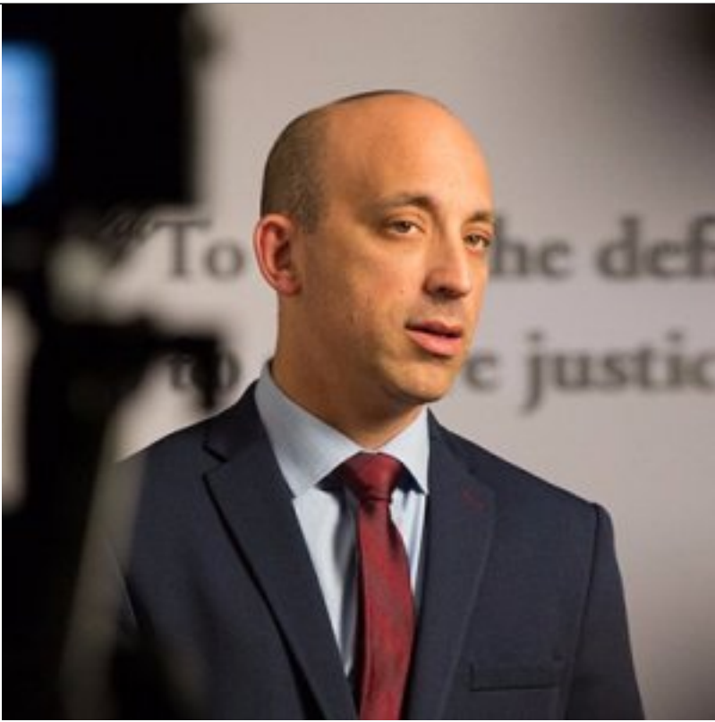
Jonathan Greenblat head of ADL

Anti-Defamation League (ADL): The ADL bills itself as a civil rights institution devoted to stamping out anti-Semitism. But in practice, it regularly works to promote Israeli interests and attacks virtually any prominent person who criticized Israel and labels them “anti-Semitic.” It has also been involved in a large spying operation against American citizens who opposed the policies of Israel and the Apartheid regime in South Africa. It is an architect of “hate crimes legislation” that may effectively criminalize criticism of Israeli policies. The ADL is a member of the CoP with revenues of around $60 million and net assets of over $115 million. Abe Foxman , its national director, makes $688,280 per year.